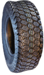
TIRE 21X7.00-10 4PLY NEW