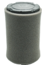
AIR FILTER KIT FOR KOHLER NEW

REPLACES REPLACE MTD 742P05177-X, FITS MTD MODELS 17ARFACS093, 17RRFACS093, 13AKA9ZS093 AND 13AKA9ZSA93